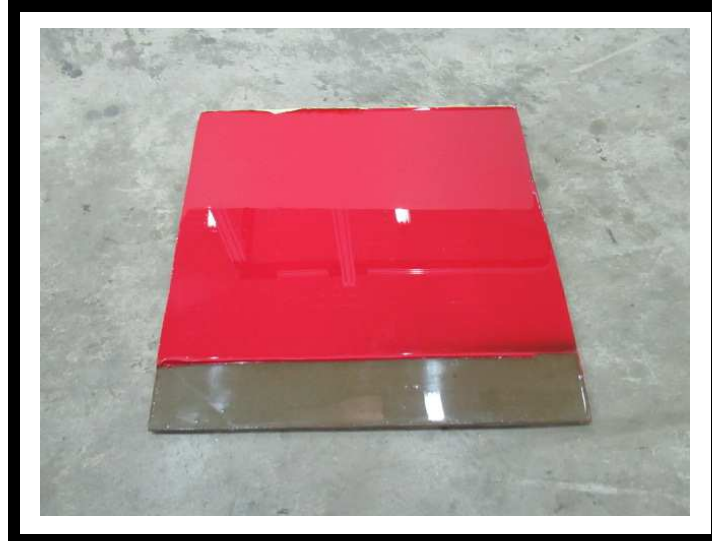
COVER PICTURE #01