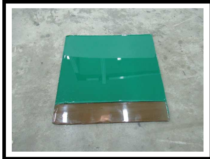
COVER PICTURE #01